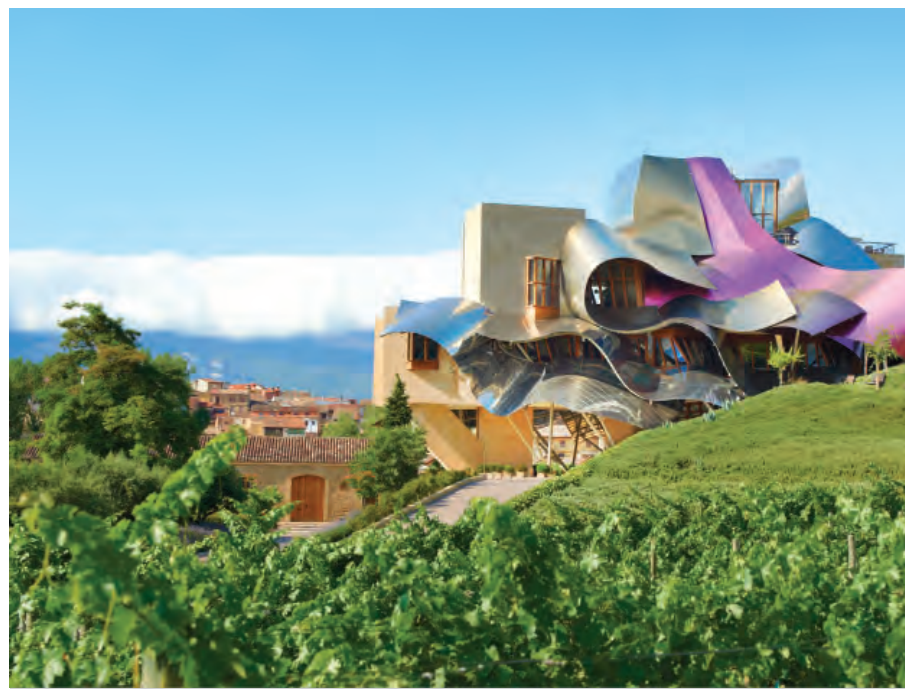
Hotel Marques de Riscal