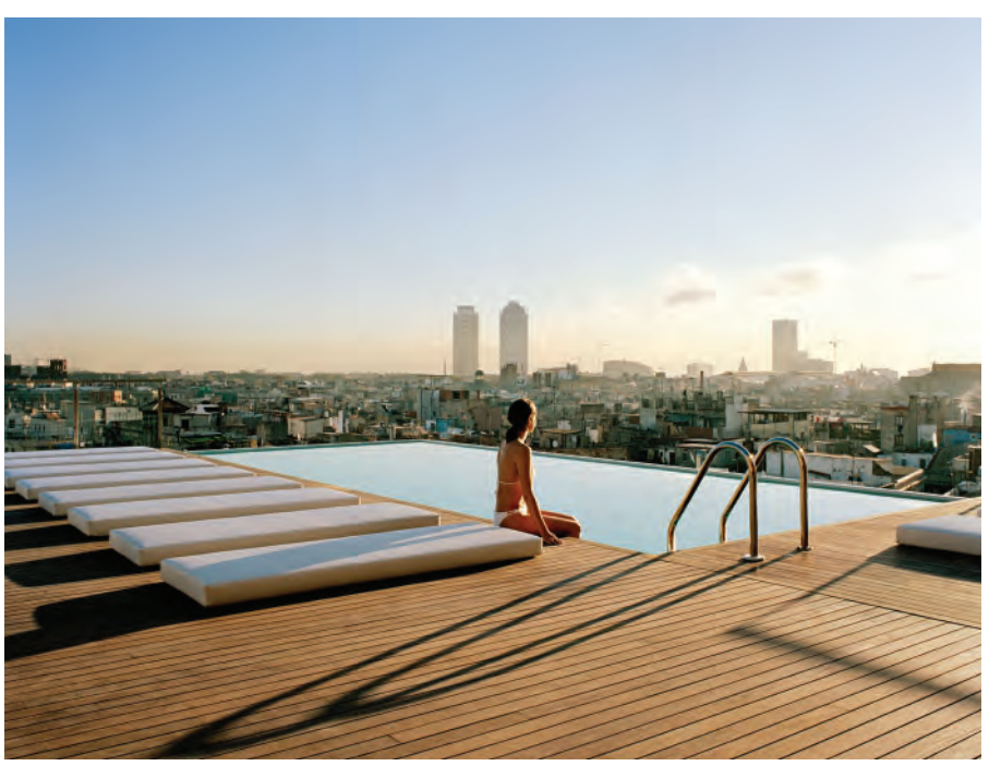
Grand Hotel Central

It is possible to add extra nights in Paris, Barcelona, La Rioja and Bilbao. Speak to one of our Personal Travel Specialists for ideas on other additional locations.